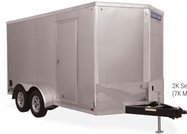
2K Set-Back Jack (7K Models)