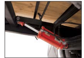
HD 5" Cylinder