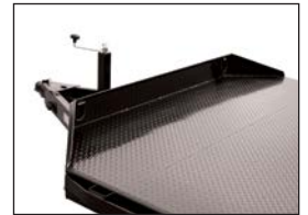
Sure-Flow™ Aerodynamic Bulkhead