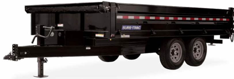
HD 12K Jack