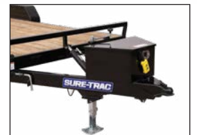
Pump Box (Hydraulics)