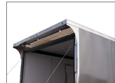
Rear Spoiler and Light Package