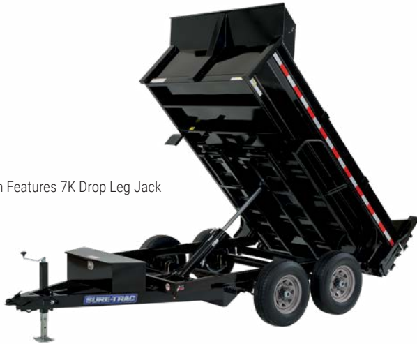
10K Model Shown Features 7K Drop Leg Jack