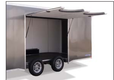
Optional Premium Escape Door