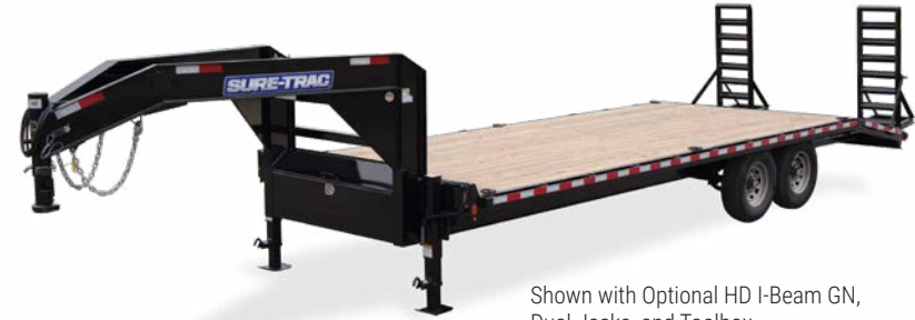
Shown with Optional HD I-Beam GN, Dual Jacks, and Toolbox