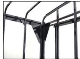
9" x 14" Corner Gussets