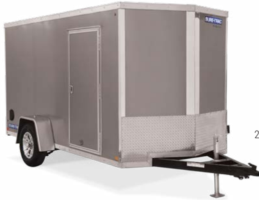
2K Set-Back Jack