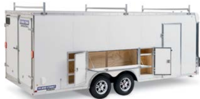
6'6" Interior Height