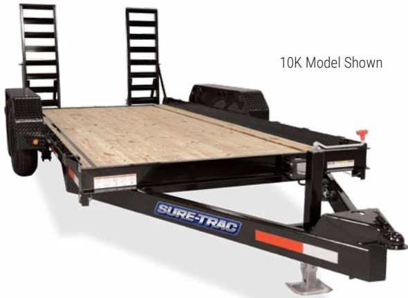
10K Model Shown