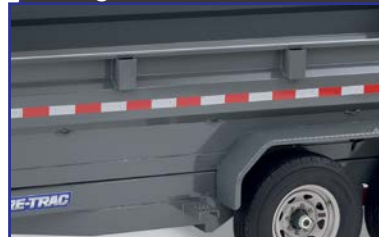
Integrated Side Panels

A smooth and sleek appeal that provides more structural support.