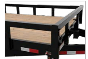
3" x 3" Tube Top Rail