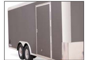
48" Side Door