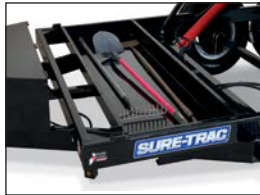
Underbody Tool Storage