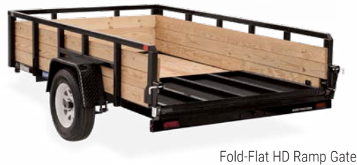
Fold-Flat HD Ramp Gate