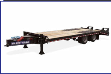
Air Brake Deckover

Air Brake Deckovers feature 40,000 lb. payload for pavers and other industrial equipment.