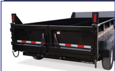
HD Multi-Function Gate

Evenly distribute your load with the spreader option or open the barn doors for easy access.