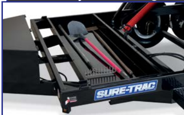
Underbody Tool Storage

Secure storage for your tools while on the job or while sitting outside.