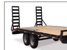
Also Available in Beavertail