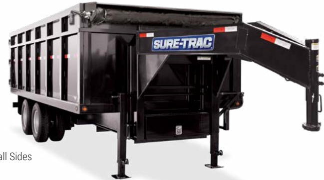
48" Tall Sides