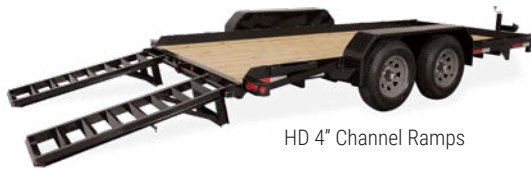
HD 4" Channel Ramps