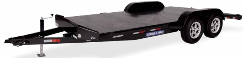
10K Model Features 7K Drop Leg Jack