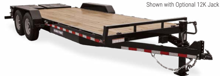
Shown with Optional 12K Jack