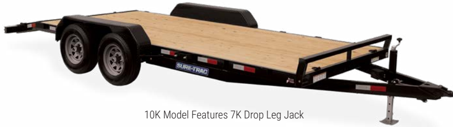
10K Model Features 7K Drop Leg Jack