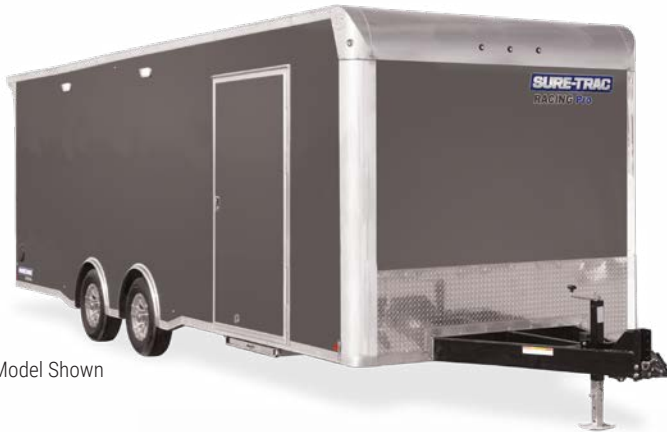
Deluxe Model Shown