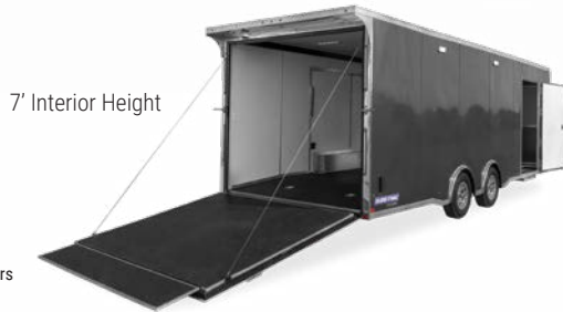
7' Interior Height