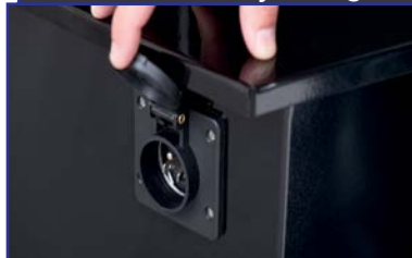
110 Volt Battery Charger

Secure storage for your tools while on the job or while sitting outside.