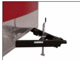
2K Set-Back Jack (7K Models)