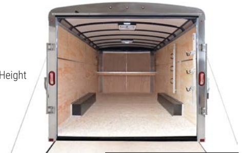
6'6" Interior Height