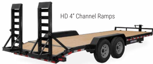
HD 4" Channel Ramps