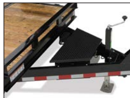
Optional Drop-In Toolbox