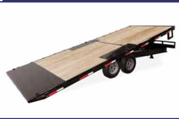
Power Tilt Deck

Optimal load angle and no ramps to make loading a breeze.