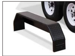
Removable Fender (Driver's Side)