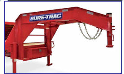
HD I-Beam Gooseneck

Provides ultimate stability to reduce sway and provide safe towing.