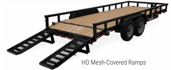
HD Mesh-Covered Ramps