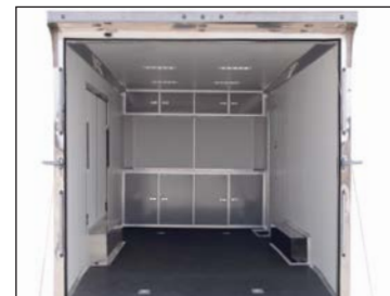
Upper and Lower Front Cabinets *Deluxe Model