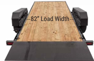
82" Load Width