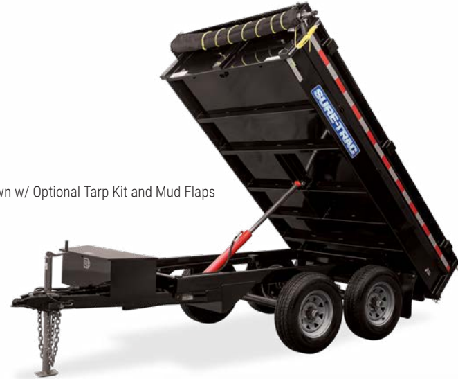
Shown w/ Optional Tarp Kit and Mud Flaps