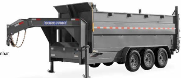
Shown with 48" Sides