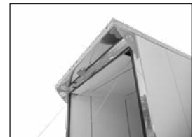
Rear Spoiler w/ Light Package