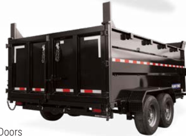
HD Combo Doors