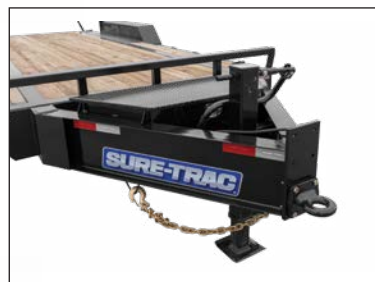
I-Beam Tongue and Frame