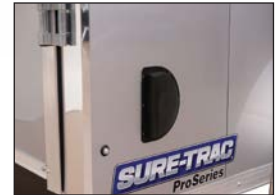
Flow-Through Scoop Vents