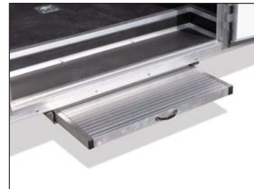
Aluminum Side Step *Deluxe Model