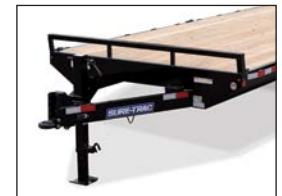
Bumper Pull Standard