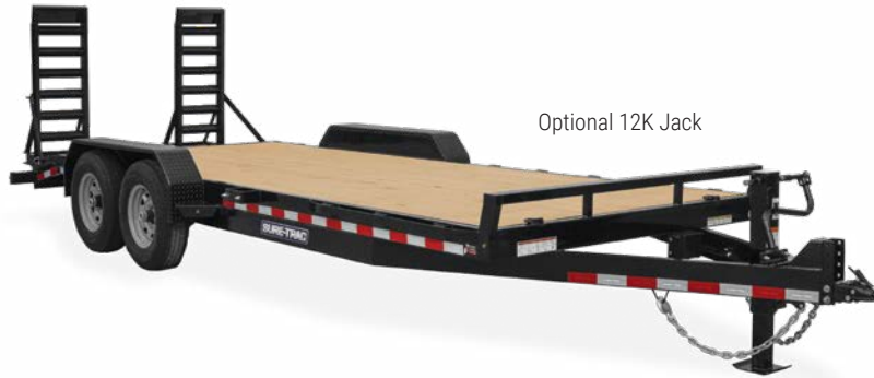
Optional 12K Jack