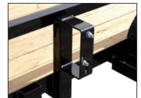
Spare Tire Carrier