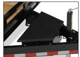
Optional Drop-In Toolbox