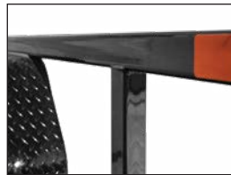
Tube Top Rail and Uprights