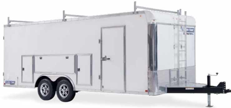
Shown with Optional Tool Crib, Ladder Racks, Front Ladder, Platform, and Barn Doors